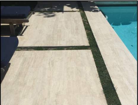
CHAMELEON GOLDEN WHITE TILE FOR HARDSCAPE OR SIMILAR