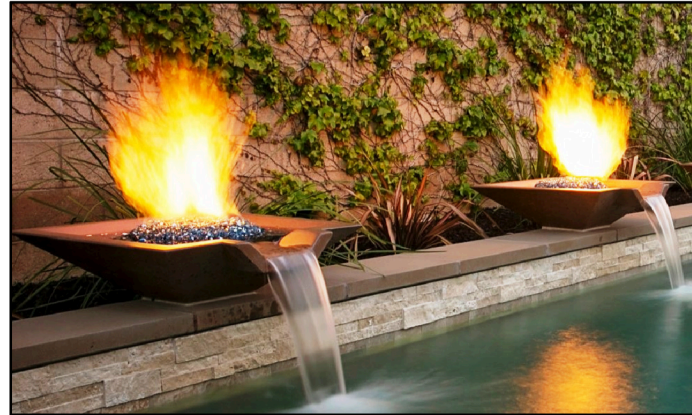
GAS FIRE BOWLS W/ WATER FEATURE