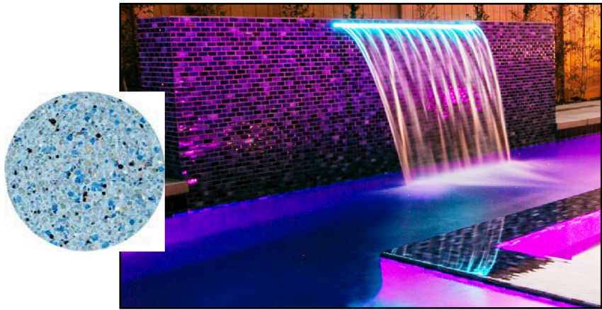
SIMILAR WATER TILE / MINI-PEBBLE TEC. FOR POOL