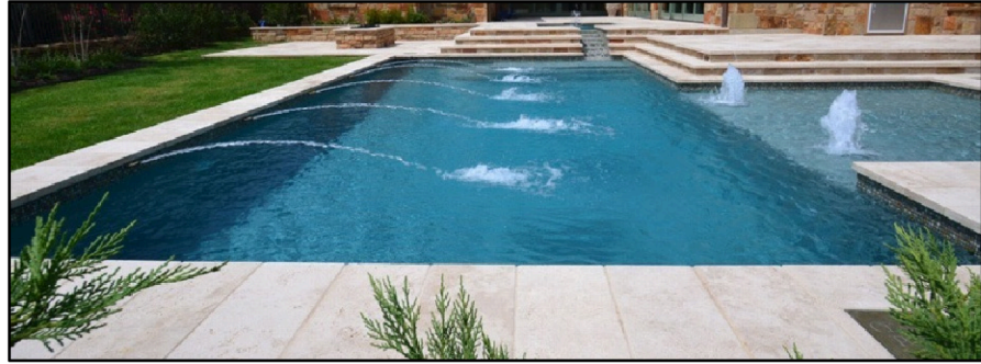
SIMILAR STYLE FOUNTAINS