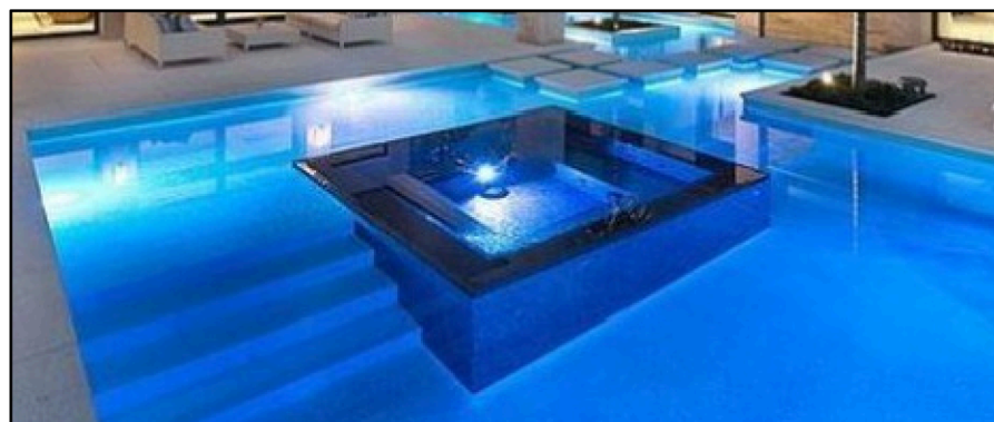
SIMILAR STYLE SPA AND POOL